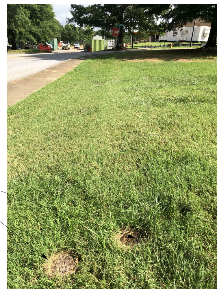
LOCATION OF CHILLED WATER VALVES THAT REQUIRE PIPE CUTTING AND BLIND FLANGES. SEE NOTE BELOW.